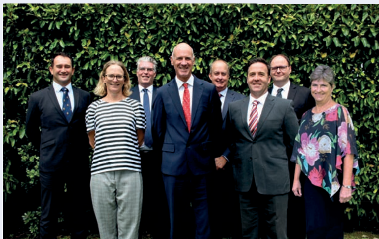
Senior Management Team

The prefect system is extended to Year 10 when seniors are on study leave, thus giving the junior boys a chance to show their leadership potential.