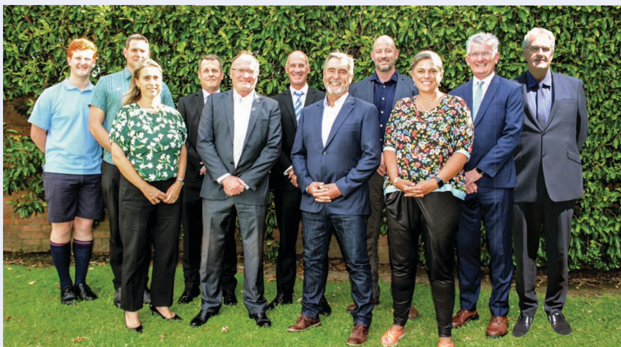
Rosmini College enjoys the very professional and dedicated support of its School Board.

Staff members provide the support system in the school for both counselling and disciplinary purposes. Boys may either be referred to, or themselves approach, the School Counsellor, the Chaplain or members of the Pastoral Care Team for help with any problem. Also part of the support team is the Careers master who provides invaluable information and advice for those boys needing direction for their future outside school.