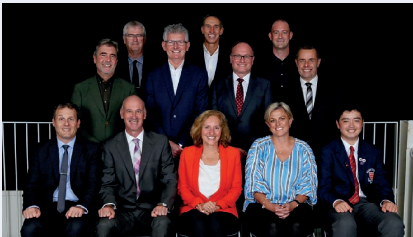
Rosmini College enjoys the very professional and dedicated support of its School Board.

Staff members provide the support system in the school for both counselling and disciplinary purposes. Boys may either be referred to, or themselves approach, the School Counsellor, the Chaplain or members of the Pastoral Care Team for help with any problem. Also part of the support team is the Careers master who provides invaluable information and advice for those boys needing direction for their future outside school.