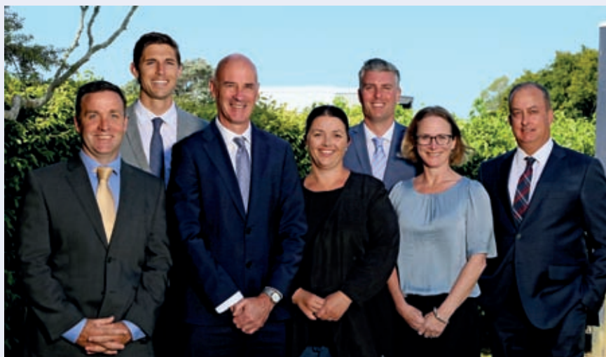
Senior Management Team

The prefect system is extended to Year 10 when seniors are on study leave, thus giving the junior boys a chance to show their leadership potential.