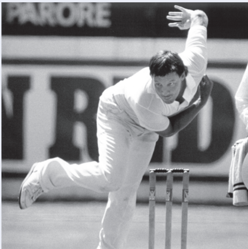
Martin Snedden in action